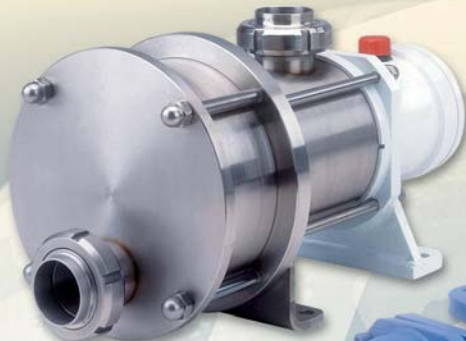
Stainless steel construction